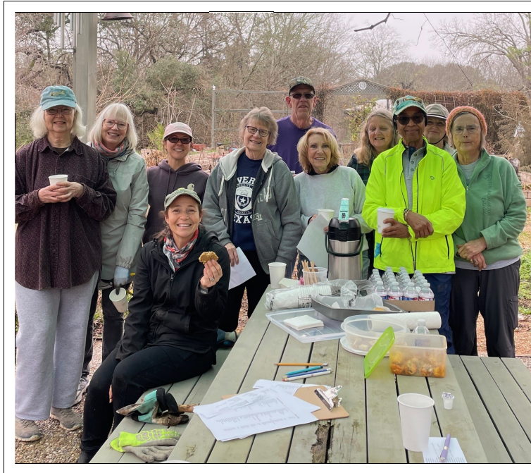
Festival Hill Pharmacy Garden Work Day Friday, January 26