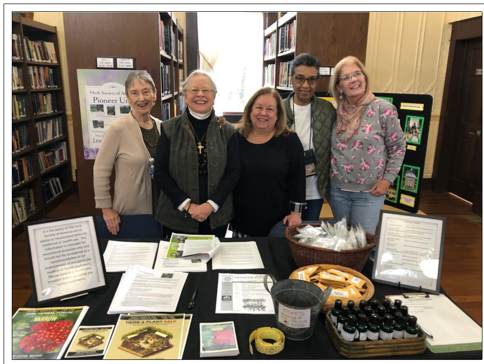
Round Top Family Library Health Fair Saturday, January 27