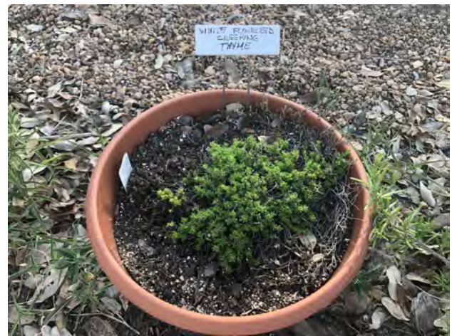
White-flowered creeping thyme — July