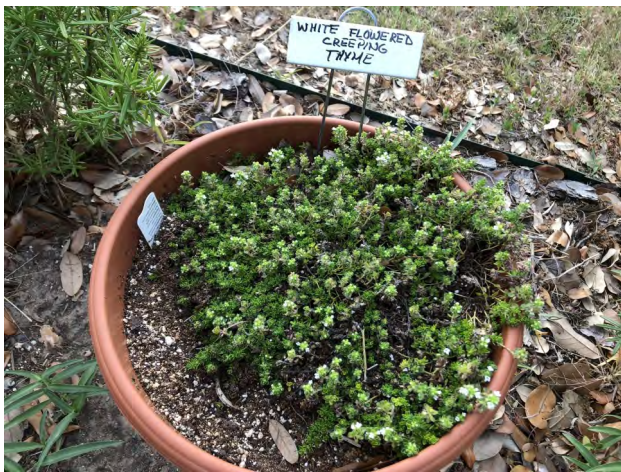
White-flowered creeping thyme — June