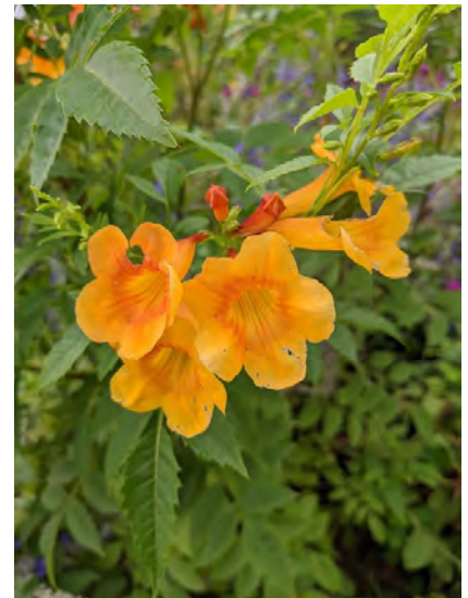
compact orange esperanza