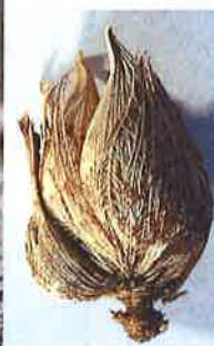
Iris reticulata —Dwarf Iris