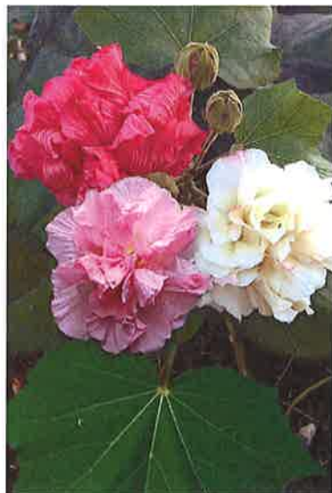
Hibiscus mutabilis — Confederate Rose Hibiscus