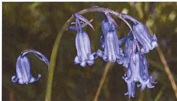
Hyacinthoides non-scripta — English Bluebell