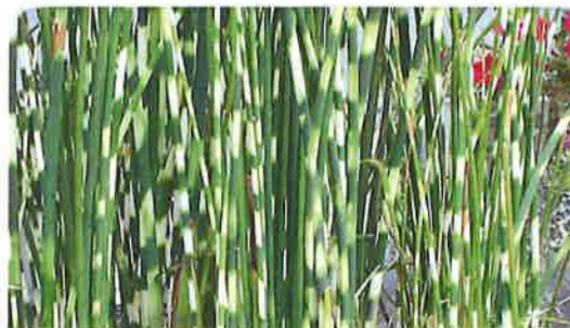
Scirpus zebrinus — Zebra Rush