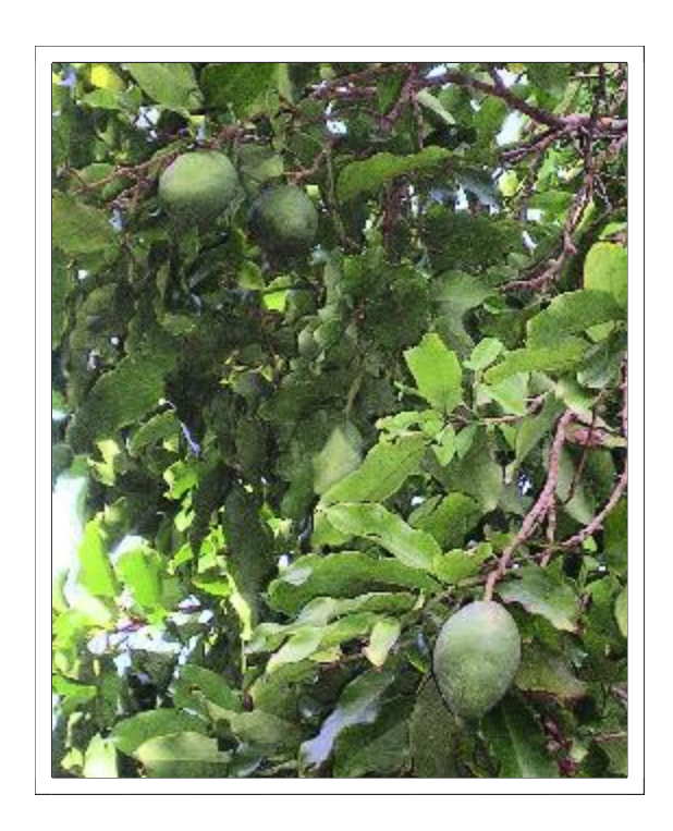
Dipteryx odorata with unripe fruit

It is the policy of The Herb Society of America not to advise or recommend herbs for medicinal or health use. This information is intended for educational purposes only and should not be considered as a recommendation or an endorsement of any particular medical or health treatment.